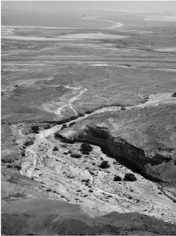
Figure 1 The study site at the lower part of Wadi Rahaf. The Dead Sea is seen in the background (to the east). Vegetation is confined within the wadi walls and dominated by acacia ( Acacia spp.) and tamarisk ( Tamarix spp.) trees. Most of the smaller shrubs visible in the wadi are Ochradenus baccatus .

1997). Fruits are rounded, fleshy white berries, 4–6 mm in diameter, containing 11.3 \pm 0.2 seeds (mean \pm SE, range: 7–16 seeds, n = 750 fruit). Although the fruits are consumed by a wide variety of animals, grackles and bulbuls are among the plant's main dispersers in this study area (Altstein 2005; Bronstein et al. 2007).